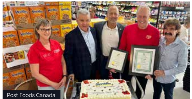
Post Foods Canada