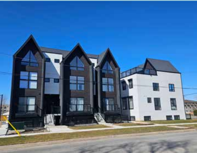
7277 Wilson Crescent THE BOHO

The Drummond is a 50-unit boutique rental community in south Niagara Falls. Located at McLeod Road and Sharon Avenue. The development, completed in 2024, offers a full suite of premium building and unit amenities, including 9-foot ceilings, luxury flooring and premium countertops in each unit.