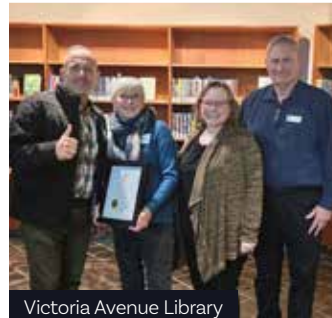
Victoria Avenue Library