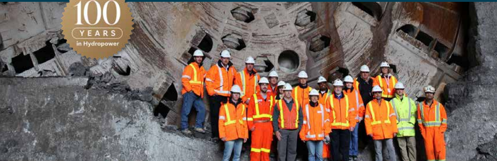
↑ One of Hatch's many accomplishments over the years is overseeing the massive Niagara Tunnel Project (2004-2013), a 10.4km long, 12.6m diameter tunnel to increase the hydropower capacity at Sir Adam Beck generating station.