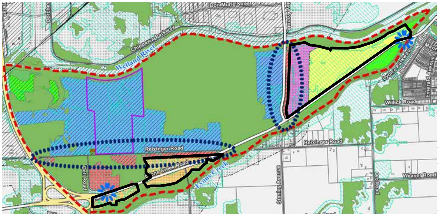
↑ Potential land usage for the Grassy Brook area includes significant protected lands (green), employment lands (blue), and residential (yellow). Studies and consultations are underway to determine the optimal land designations.

A comprehensive Secondary Plan study is now under way, to consider the local context, environmental conditions, infrastructure investment, land use compatibility, urban design, cultural heritage, and other elements to provide a policy framework and direction for employment and residential development in the area.