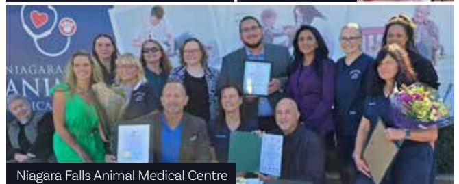
Niagara Falls Animal Medical Centre