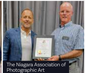
The Niagara Association of Photographic Art