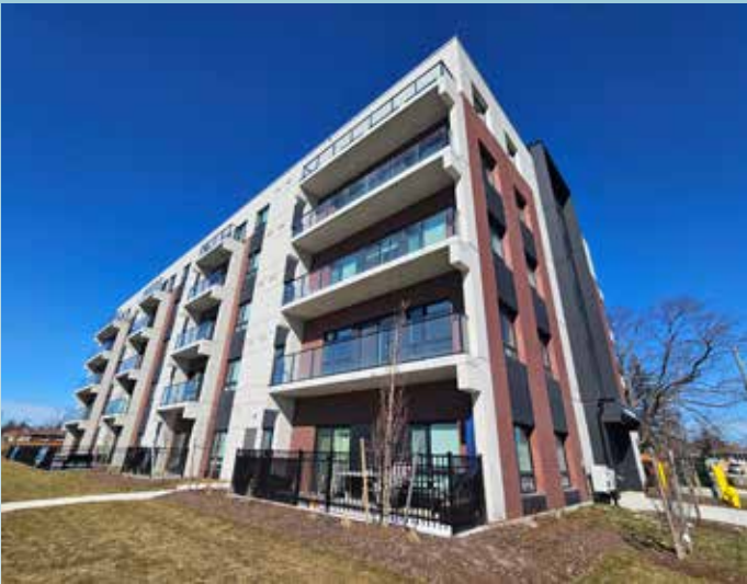
7219 Sharon Avenue THE DRUMMOND BY LIVEWELL

The Drummond is a 50-unit boutique rental community in south Niagara Falls. Located at McLeod Road and Sharon Avenue. The development, completed in 2024, offers a full suite of premium building and unit amenities, including 9-foot ceilings, luxury flooring and premium countertops in each unit.